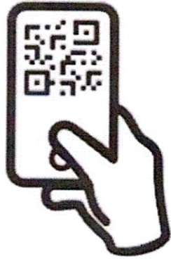
using a smartphone